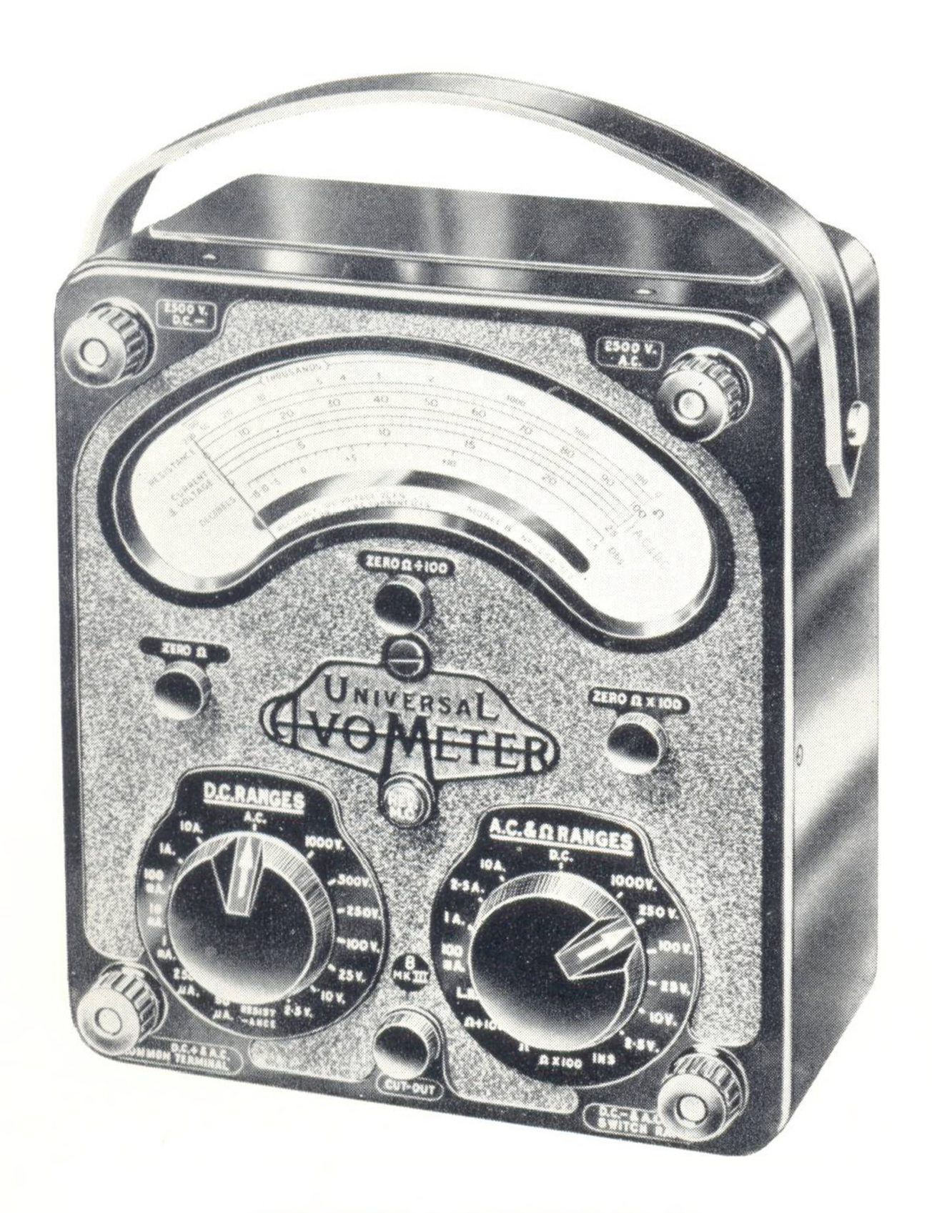
THE MODEL 8 AVOMETER Mk. III