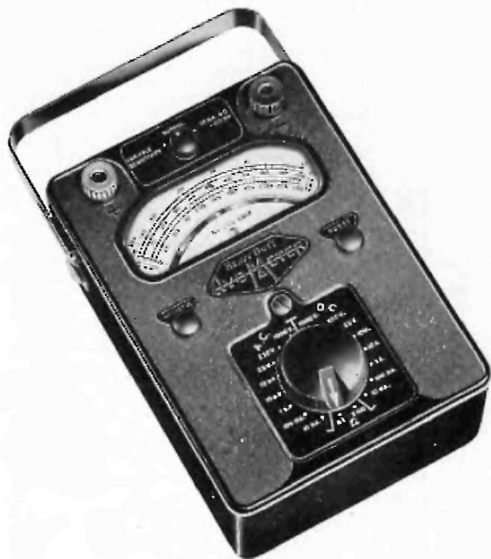
Heavy Duty Avometer Mk. 5

No information on diagrams in whole or part may be copied or reproduced without the prior permission in writing of AVO LIMITED. Whilst every care has been taken in the compilation of this publication, Avo Ltd. cannot accept any liability due to errors in the text.