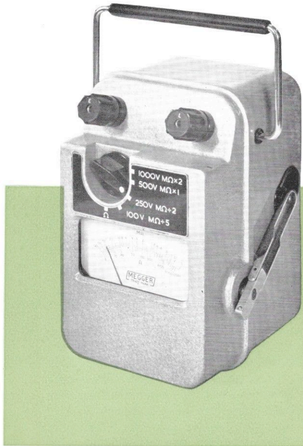
The Major Megger Tester (Cat. No. 70154)

WITH the substitution of the Series 2 range of instruments by Major 'Megger' Testers, one might feel that it is the end of an era, but this is not quite so. The Major range of instruments is part of the natural evolution of testing instruments of this type, and in many ways, besides incorporating the technical advances of recent years, also solves, to a considerable extent, production problems associated with the manufacture of Insulation Testing Instruments.