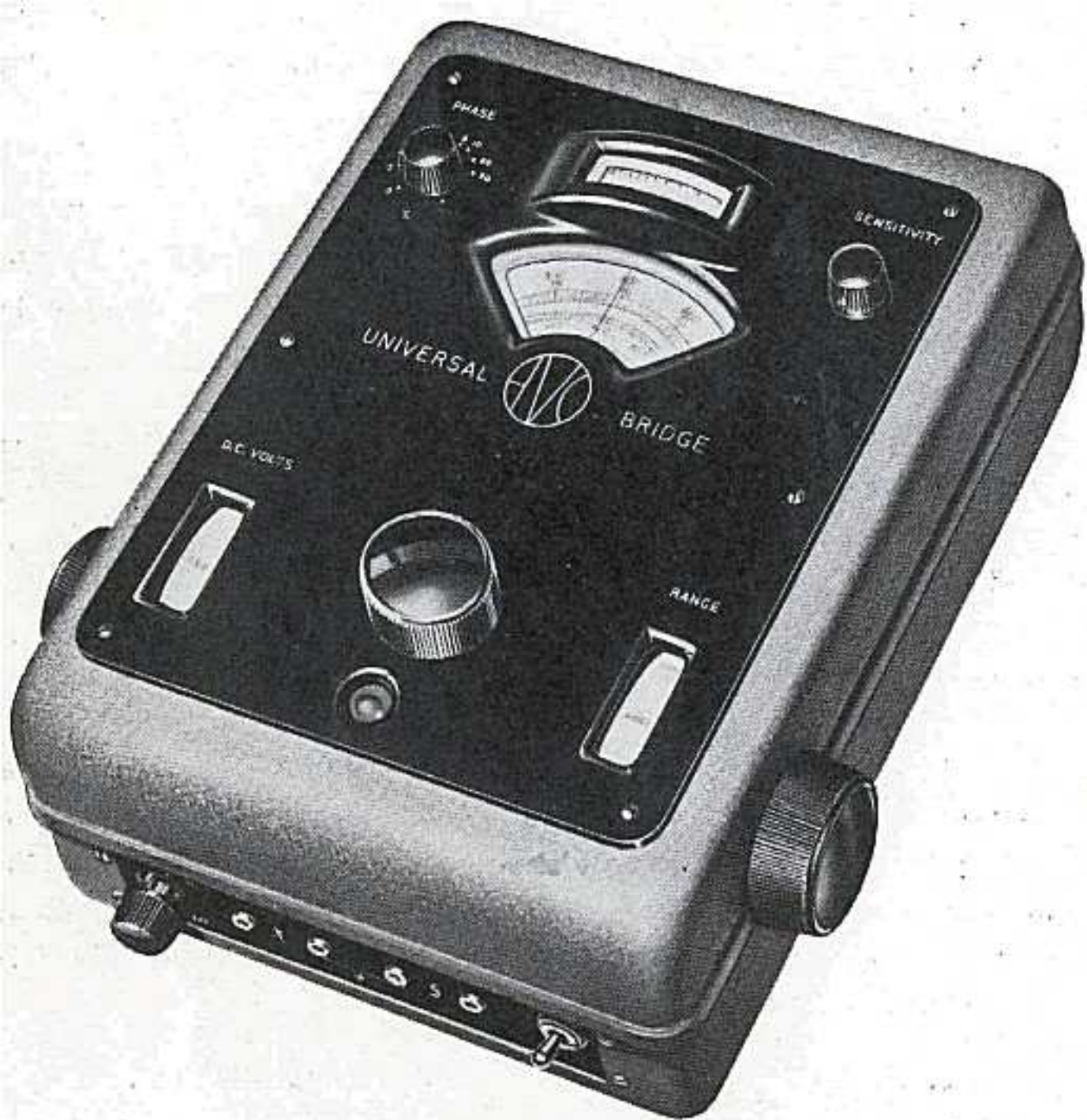
THE "AVO" UNIVERSAL BRIDGE